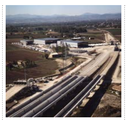
■ High speed railway from Milan to Bologna, Italy

"At the Company our aim and policy is to focus on the needs of our customers, as well as providing transparency in all interactions with financial operators, local authorities