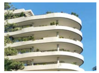
■ Petite Afrique, Monaco

"Our administrative processes are constantly updated via dedicated procedures that employ the use of custom software," describes Aguglia. "This allows for a very fast data transfer between offices that are thousands of miles apart, therefore allowing for smoother communications between colleagues located in different places and enabling successful interaction and collaboration."