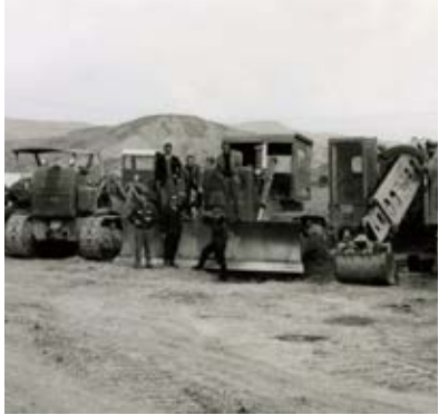
■ More than 100 years of industry experience

In more recent years, the Company has the best possible technical result been focused on a persistent search for advanced technology solutions that for sustainability of the projects.